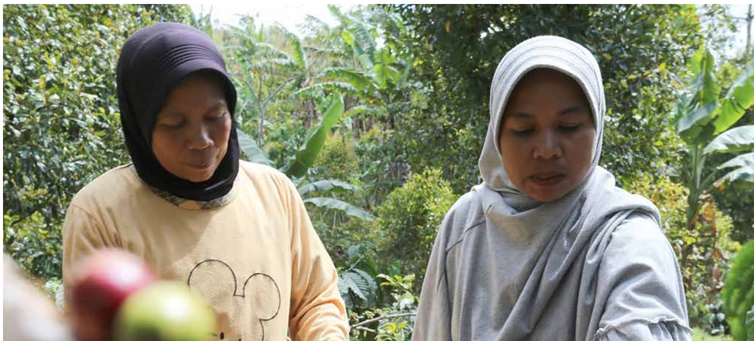
Female farmers in Bantaeng harvesting coffee.

Evidence shows that women often rely on hired labour, while men invest more of their own or family labour in their farms (Ayodele 2020). This labour constraint can increase women's production costs, reduce profits and discourage agroforestry adoption. Poor women with limited financial resources are especially affected, and the shortage of labour resources in female-headed households can lead to reduced productivity and efficiency (Kiptot and Franzel 2011).