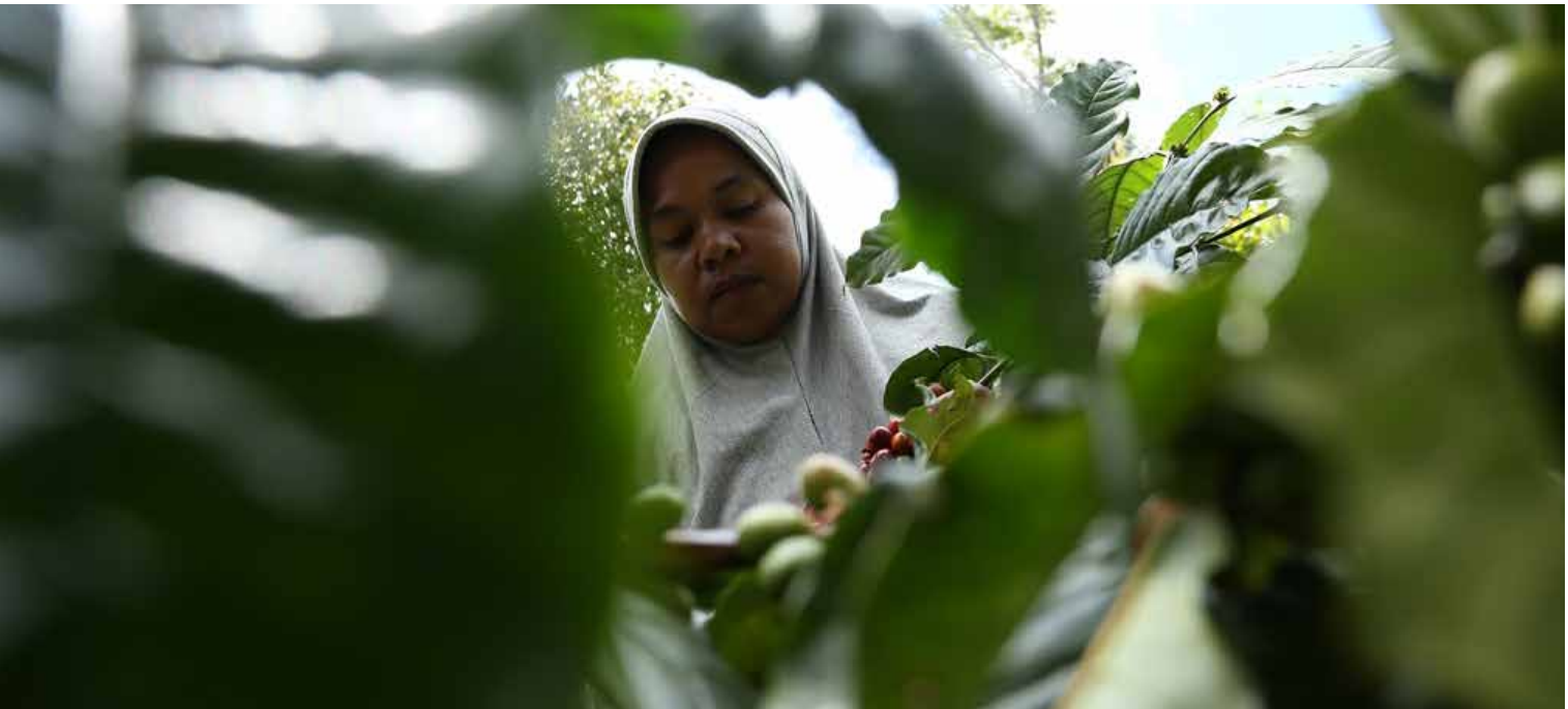
A female farmer in Campaka village harvesting coffee.

practice of agroforestry on a global scale. This imbalance is evident in various regions, as revealed by research conducted by Jahan et al. (2022) in Bangladesh, along with similar findings by Kiyani et al. (2017) in Rwanda and Kouassi et al. (2021) in Côte d'Ivoire.