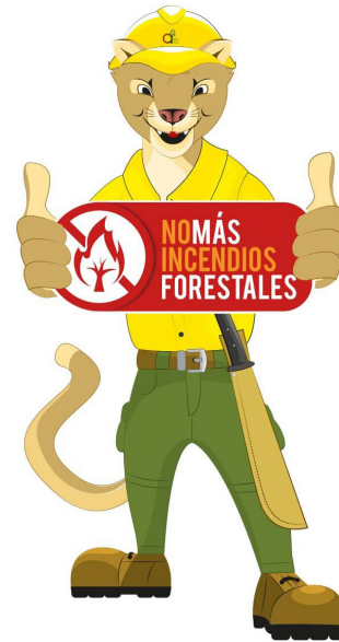
Figure 3. The national mascot for forest fire prevention in Ecuador, a puma called Urku El Puma.

Much effort has been made since 2017 to show the two faces of fire to the public, with the help of local and national programme partners. This includes the development of environmental educational materials and courses on forest fire prevention aimed at teachers in schools and colleges, and talks in schools, universities and communities. During the Covid-19 pandemic, the emphasis shifted to webinars, radio programmes, educational videos and use of social networks. A virtual course (Introduction to Integrated Fire Management) was developed (MAATE 2021), and a national mascot was adopted (Figure 3). Although communication takes place year-round, it intensifies in August to December.