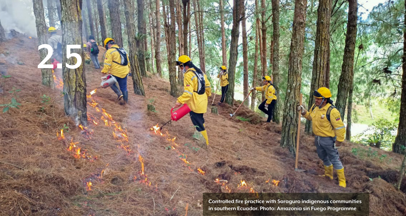
Controlled fire practice with Saraguro indigenous communities in southern Ecuador.