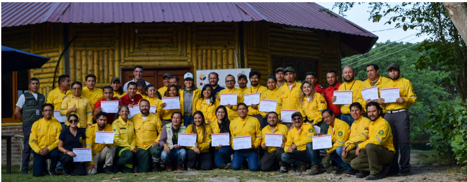
Fire brigade trainees after an inter-institutional course on forest fire prevention, Guayas Province, June 2022, supported by IBAMA from Brazil.

Globally, it is increasingly accepted that it is essential to learn to live with fire (Hernández et al. 2020). Thus, a shift in approach is needed, to accept the presence of fire and change the way that land is managed by communities. This is one of the greatest challenges facing national and local authorities. International donors and national and local actors need to be aware of this, and need to radically redirect their investments in forest fires from emergency responses and firefighting to prevention and integrated management.