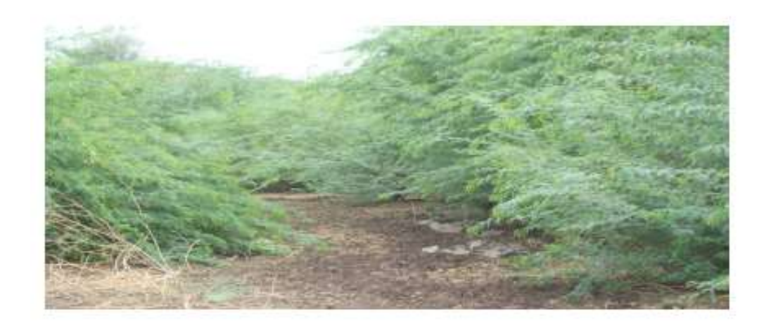
NATIONAL STRATEGY ON PROSOPIS JULIFLORA MANAGEMENT